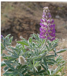
SILVER LUPINE Lupinus leucophyllus (summer, dry)