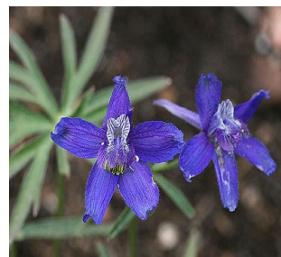
LARKSPUR (poisonous) Delphinium nuttallianum