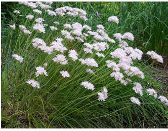
PAPER ONION Allium amplectans Use: edible