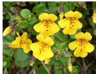
YELLOW MONKEY FLOWER Mimulus guttatus (late spring, wet)