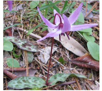
HENDERSON'S FAWN LILY Erythronium hendersonii