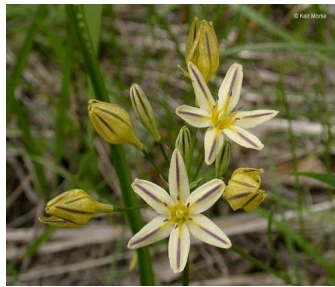
YELLOW BRODIAEA Triteleia crocea (early summer, dry grassland)