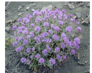
COYOTE MINT Monardella odoratissima (late summer, dry) Use: tea, medicinal