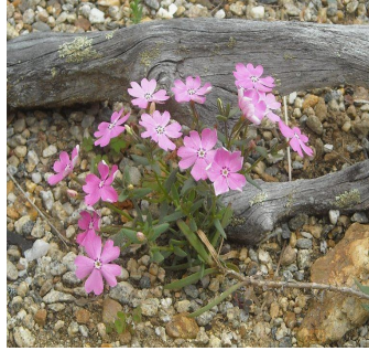
SHOWY PHLOX Phlox speciosa (late spring, dry)