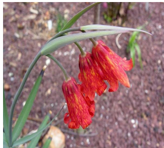
RED BELLS Fritillaria recurva (dry, forest, early summer)