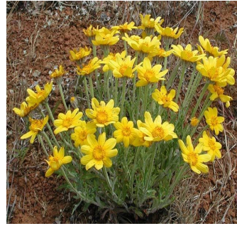
OREGON SUNSHINE Eriophyllum lanatum