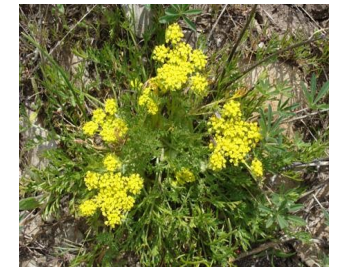
BISCUIT ROOT Lomatium utriculatum Use: all parts edible