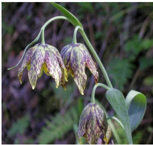
CHECKER LILY Fritillaria affinis (dry forest, early summer)