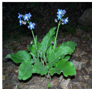
HOUND'S TONGUE Cynoglossum grande