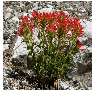
PAINT BRUSH Castilleja applegateii