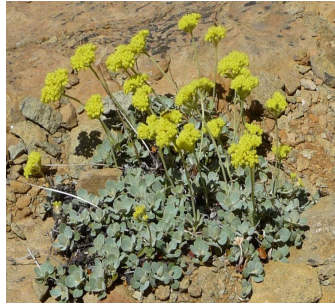
SULFUR FLOWER Eriogonum umbellatum