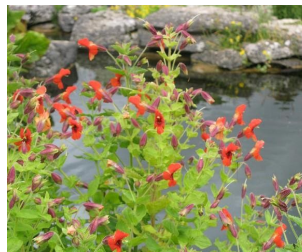
RED MONKEY FLOWER Mimulus cardinalis (summer, wet)