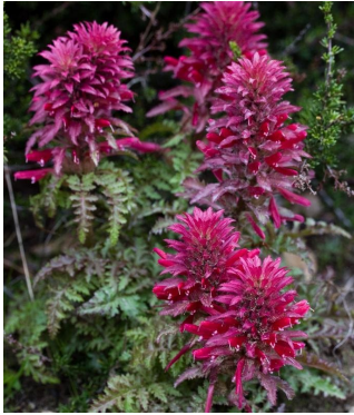
INDIAN WARRIOR Pedicularis densiflora (early spring, dry forest)