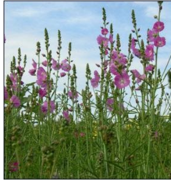
CHECKER-BLOOM Sidalcea malvaeflora (late spring, meadow)