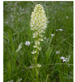
DEATH CAMAS (poisonous) Zigadenus venenosus