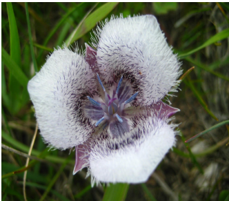
CAT'S EARS Calochortus tolmeii