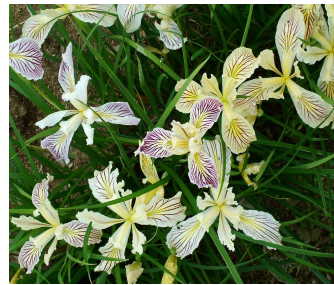
YELLOW IRIS Iris chrysophylla Use: leaf fibers for rope