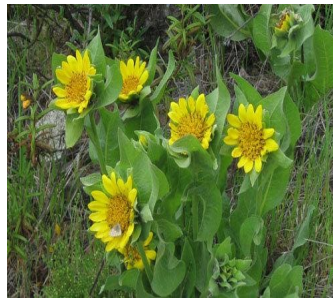
MULE'S EARS Wyethia glabra (early summer, dry grassland)