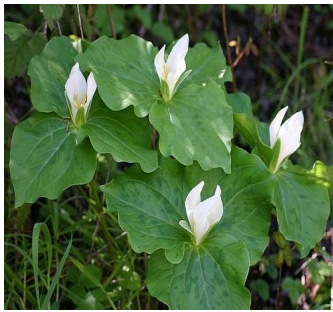
GIANT WAKEROBIN Trillium albidum (late spring, wet, shady)