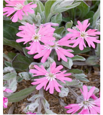
INDIAN PINK Silene hookeri (late spring, dry forest)