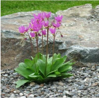
SHOOTING STAR Dodecatheon hendersonii Use: flowers considered good luck charm