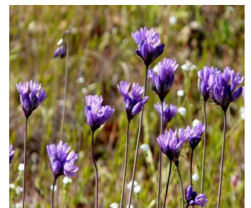
BLUE DICKS Dichelostemma capitatum