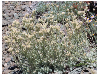
PUSSY TOES Antennaria argentea (summer, dry)