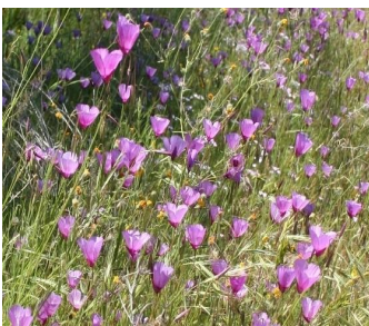
WINECUP Clarkia purpurea