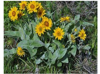
BALSAM ROOT Balsamorhiza deltoidea Use: edible seeds when ground