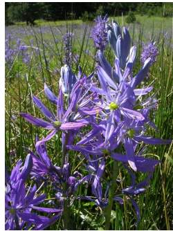
CAMAS (spring, wet) Camassia quamash Use: bulb ground for flour