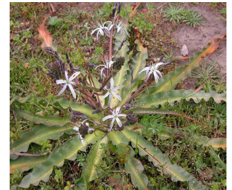
SOAP PLANT Chlorogalum pomeridianum (flowers in evening) Uses: roots for brush, bulb for soap